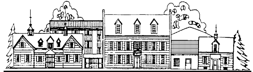
IMMANUEL LUTHERAN COLLEGE